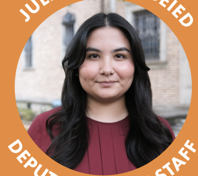
DEPUTY CHIEF OF STAFF