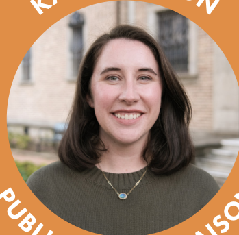
PUBLIC AFFAIRS LIAISON