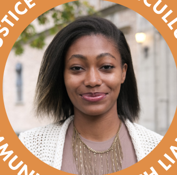
COMMUNITY OUTREACH LIAISON