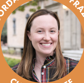
CHIEF OF STAFF