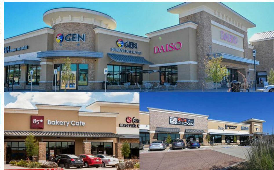
FRISCO RANCH CENTER