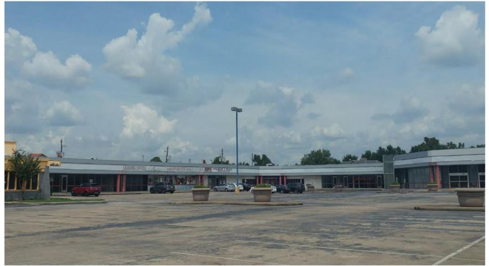
WESTHEIMER PAVILION CURRENT PHOTOS