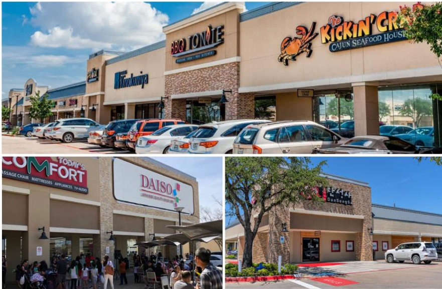
CARROLLTON TOWN CENTER