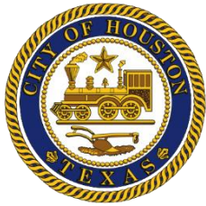
Mayor Sylvester Turner