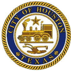
Mayor Sylvester Turner

Presented to Quality of Life Committee September 28, 2016