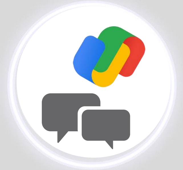
Digital Payment Methods