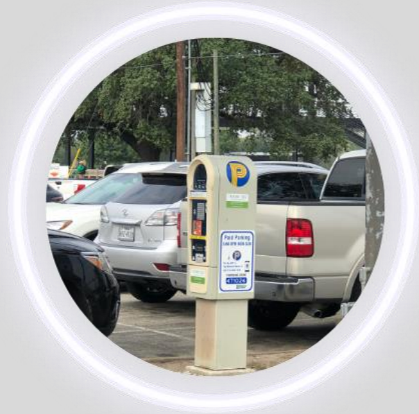
Solar-Powered Pay-by-Plate Meters