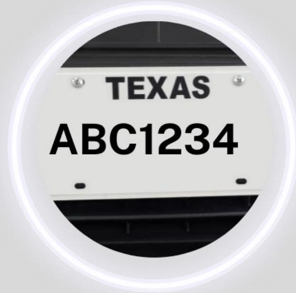
Handhelds and LPRs