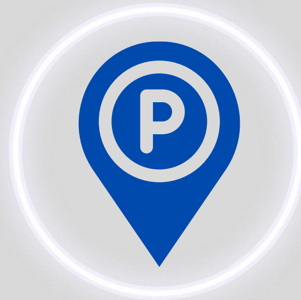
Curbside Parking Space Availability