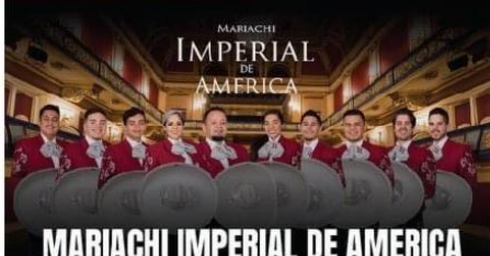
MARIACHI IMPERIAL DE AMERICA