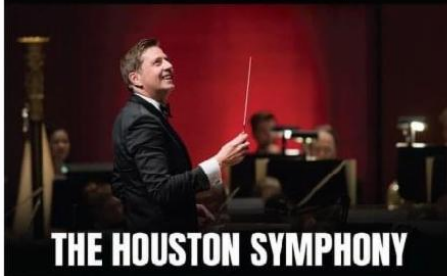
THE HOUSTON SYMPHONY