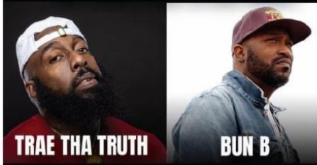
TRAE THA TRUTH