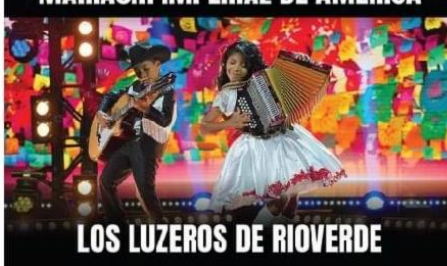
LOS LUZEROS DE RIOVERDE