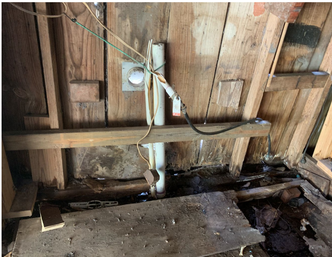
Figure 4: Interior Wall