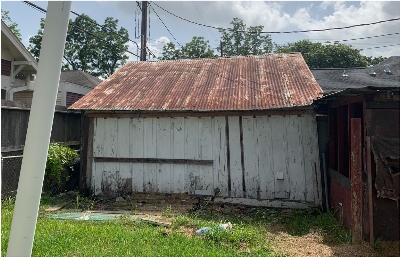
Figure 2: East Elevation