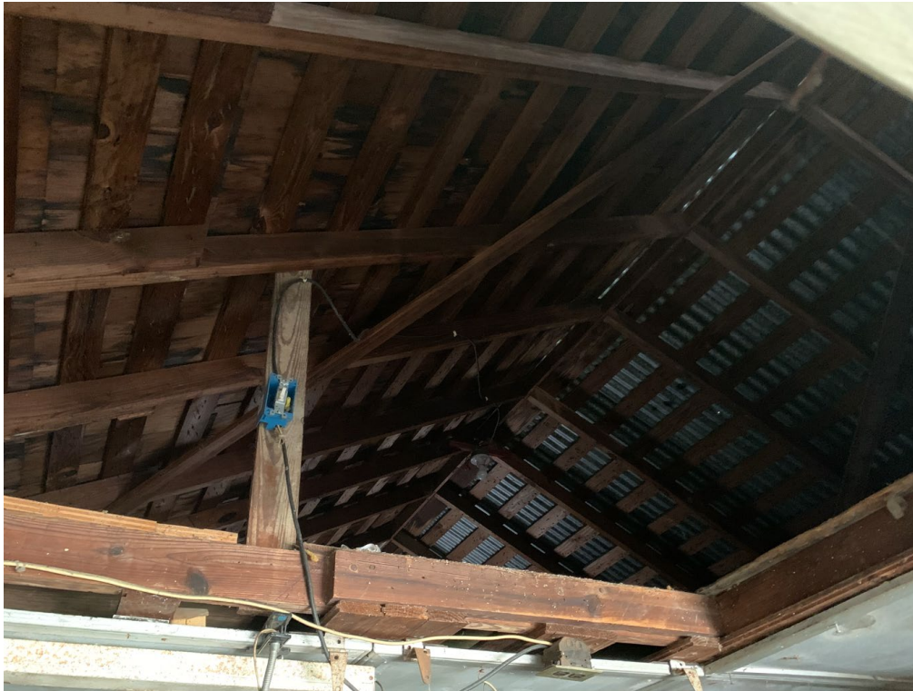
Figure 6: Roof Structure