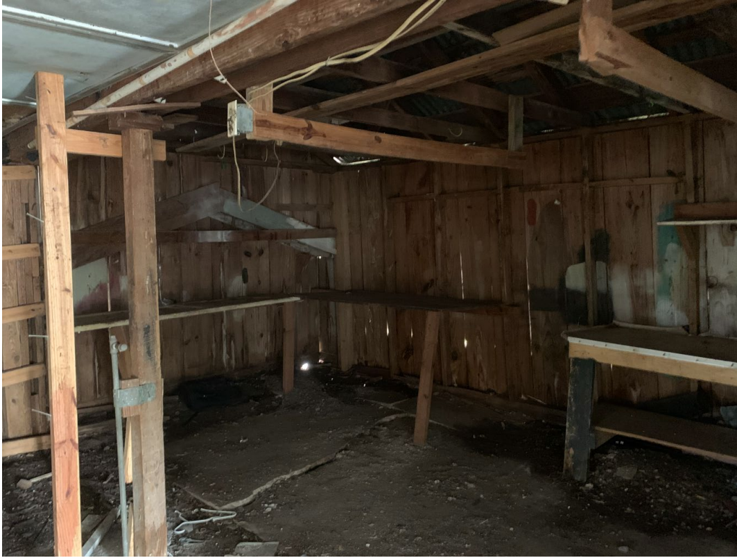
Figure 5: Interior Wall/Ceiling