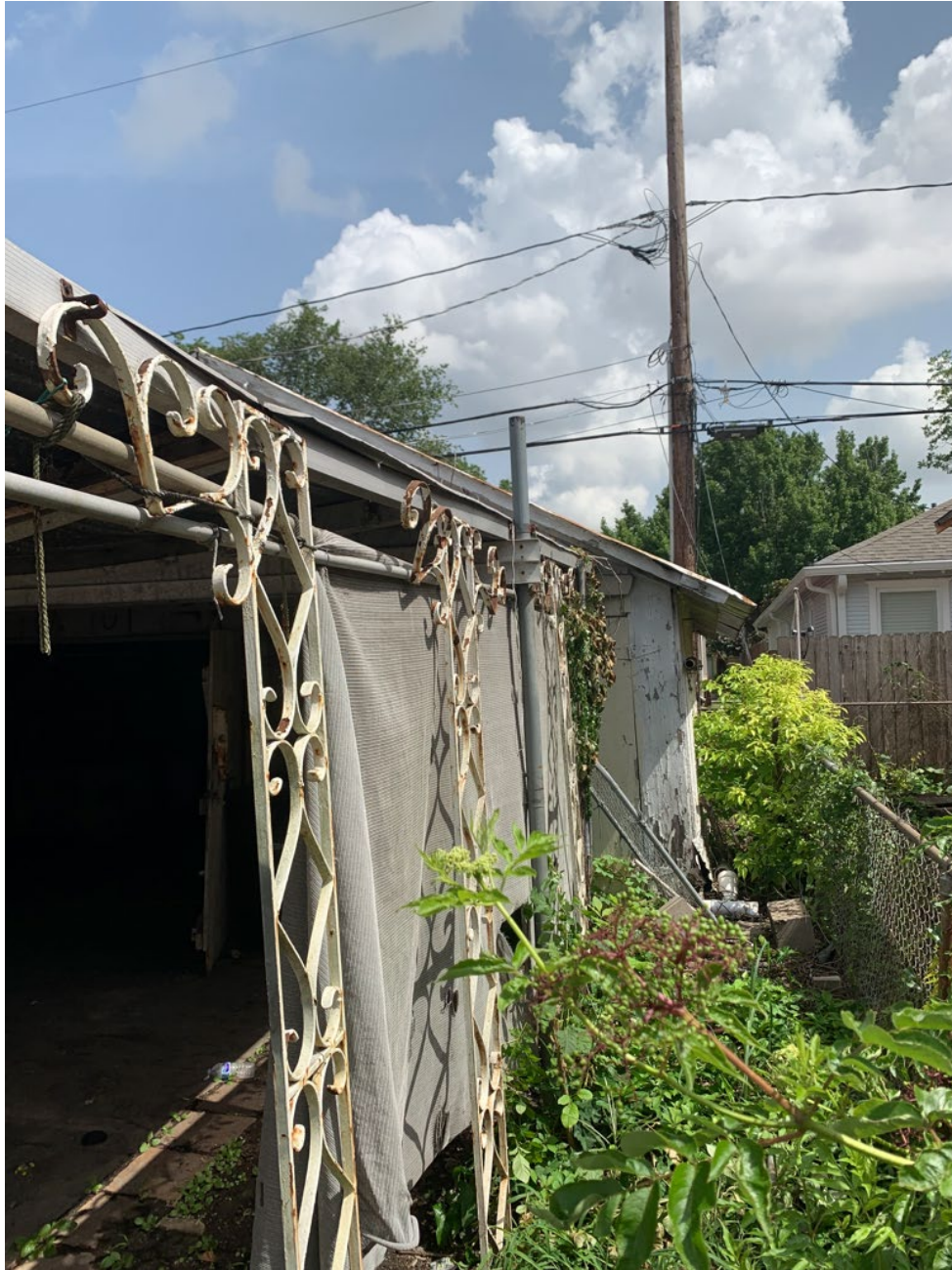
Figure 1: West Elevation