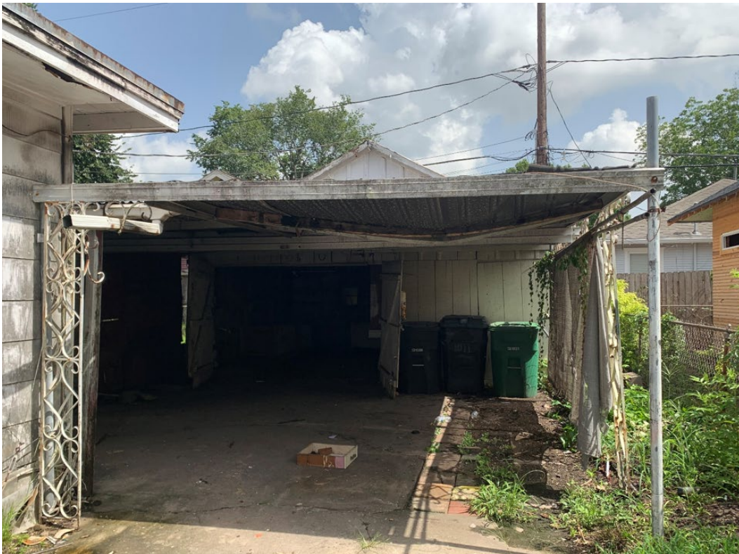
Figure 3: North Elevation