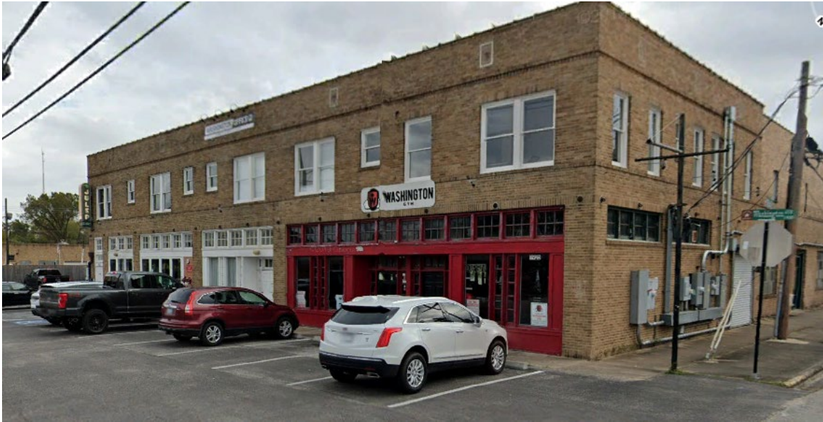
CURRENT PHOTO (proposed sign)