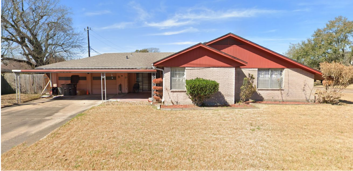
Figure 1: Elevation at Dover St