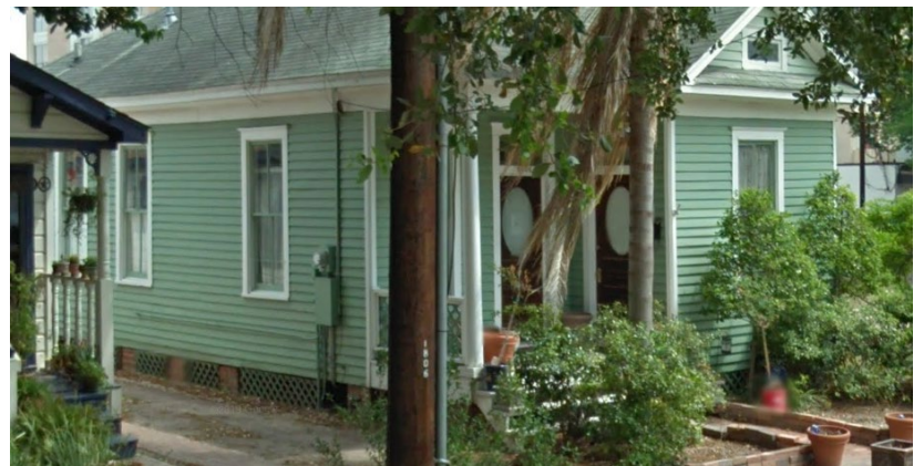
DOUBLE ENTRY SIMILAR TO 1804 DECATUR