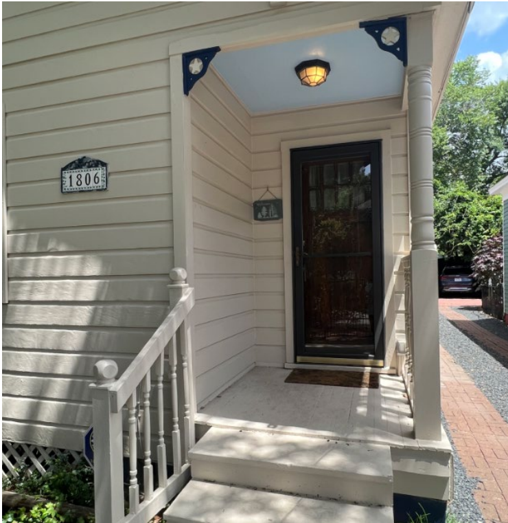
CURRENT PHOTO (DOOR TO REMAIN/WALLED FROM INSIDE)