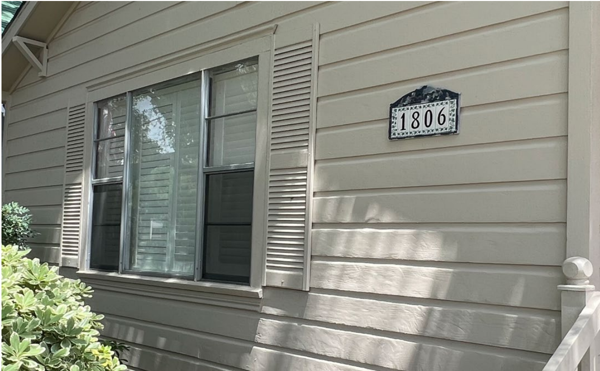
PROPOSED – SAME LITE PATTERN FOR FRONT WINDOW (83" X 56")