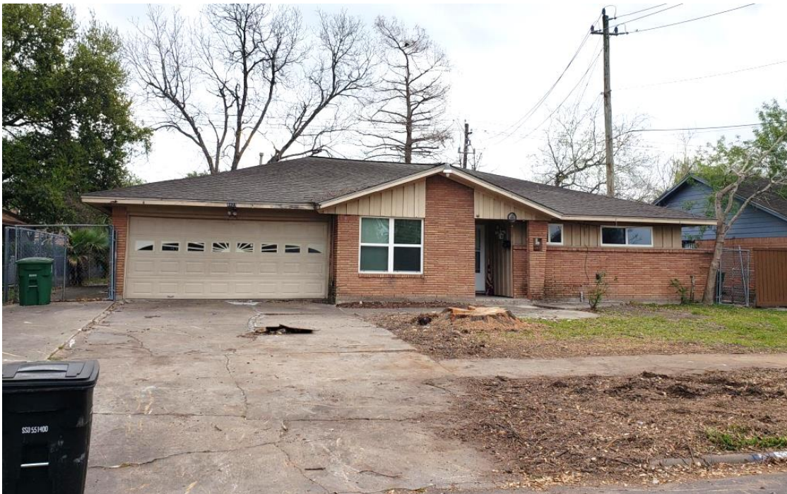
Figure 2 - COH Investigator photo

For additional images see attached investigator images.