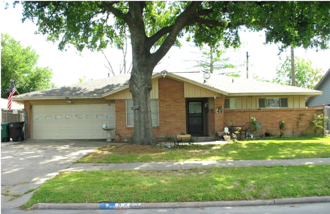
Figure 1 – Inventory Photo - 2010