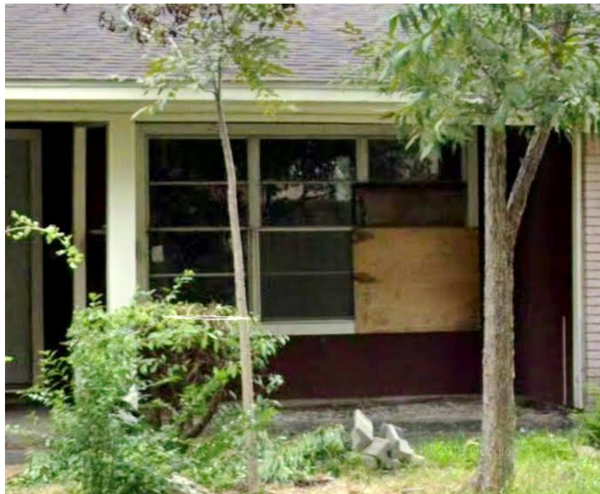
Figure 6 - Original Porch Windows