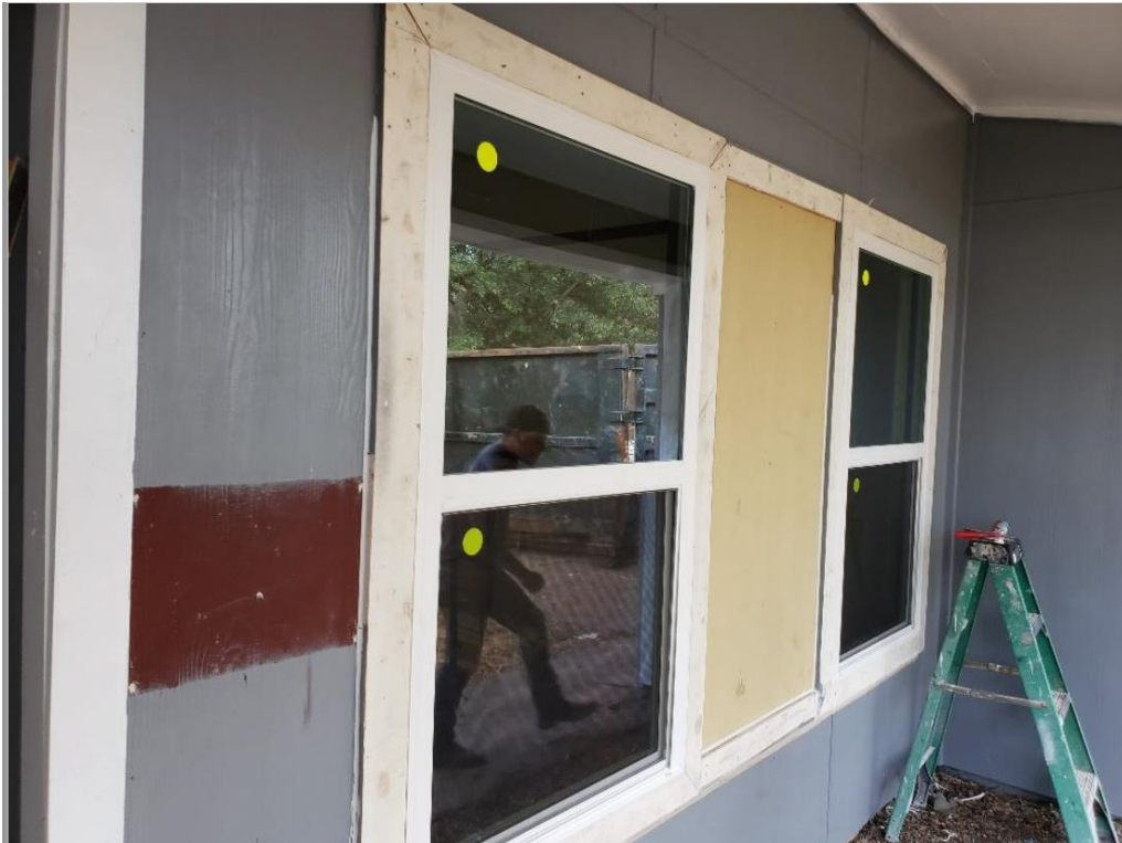
Figure 5 - Original Location of 3 Aluminum Windows