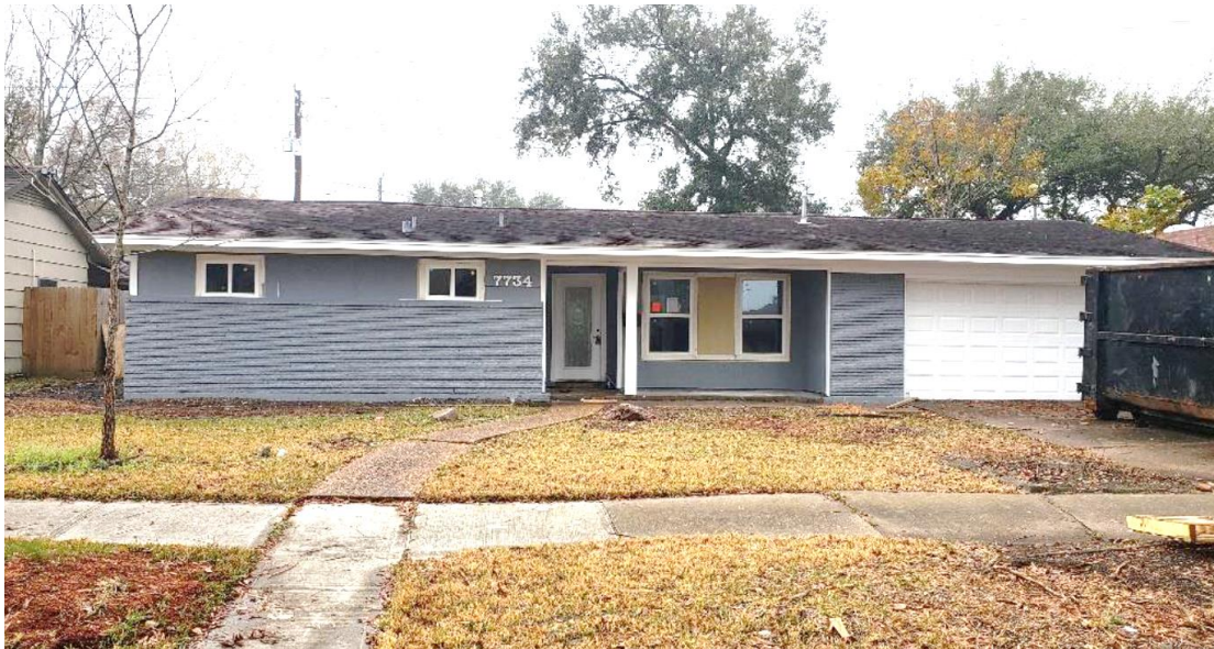
Figure 2 - Feb. 2022