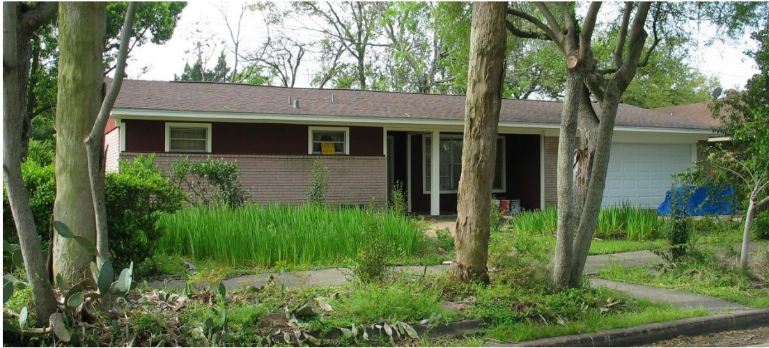
Figure 1 - Inventory Photo April 2010