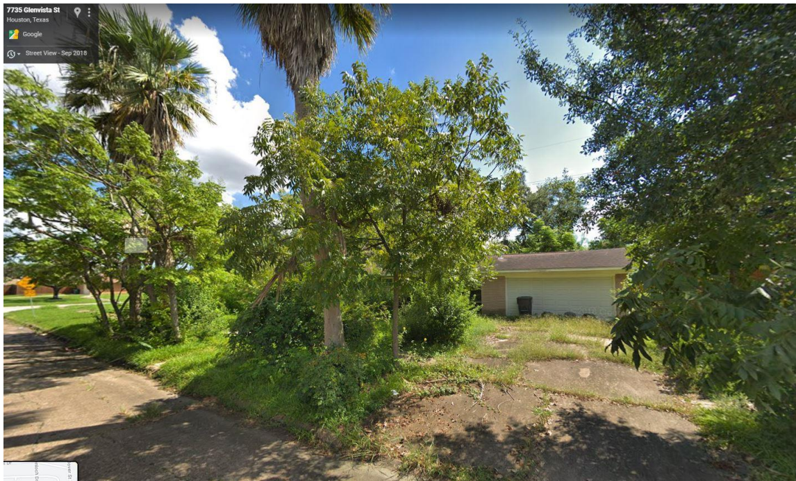
Figure 4 - Google 2018