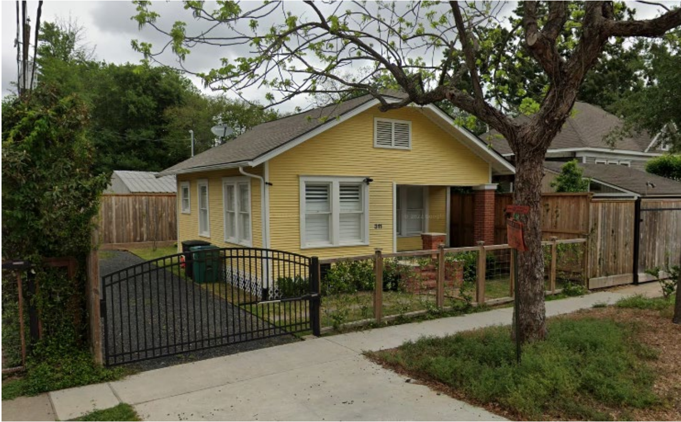
Figure 1 - Current Streetview